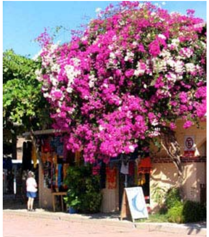
Shopping in Zipolite Beach

We really like having solar panels on the top of our RV. The last two places we stayed in did not have electricity but with all the sun, we had no problems keeping our batteries fully charged. We run our generator only for the microwave or toaster. We brought a lot of frozen meat from home but buy fresh fruit & vegetables, which are very good and inexpensive. We found a great restaurant here with well-prepared food that cost only $11 for two including beer and tip.