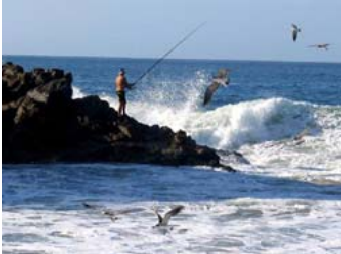
Fishing off rocks at end of Zipolite Beach

We enjoyed beach walking, bike riding, bird watching and trips to the little town of La Crucecita to shop at their market. Finally on Thursday after spending 9 days in Huatulco, we headed to Puerto Angel's, Zipolite beach.