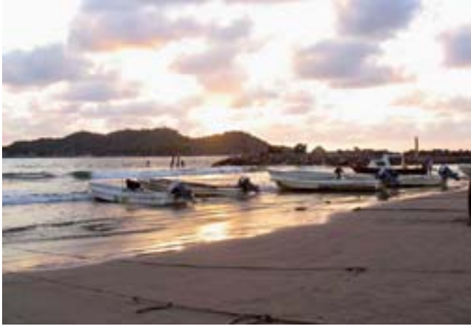
View of Isla Ixtapa from our camp at sunset.

end of Ixtapa called Playa Linda. Tourists here can catch a small boat to go out to the offshore, Isla Ixtapa, which is packed with little beach restaurants. But by night time all the people are gone.