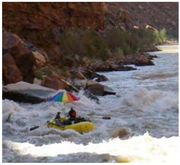
Cathy Needham & Elliott Drysdale in the Fiesta raft riding the big waves at House