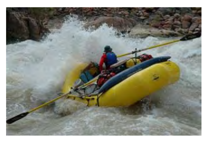
Carl & Donna Homberg at Crystal